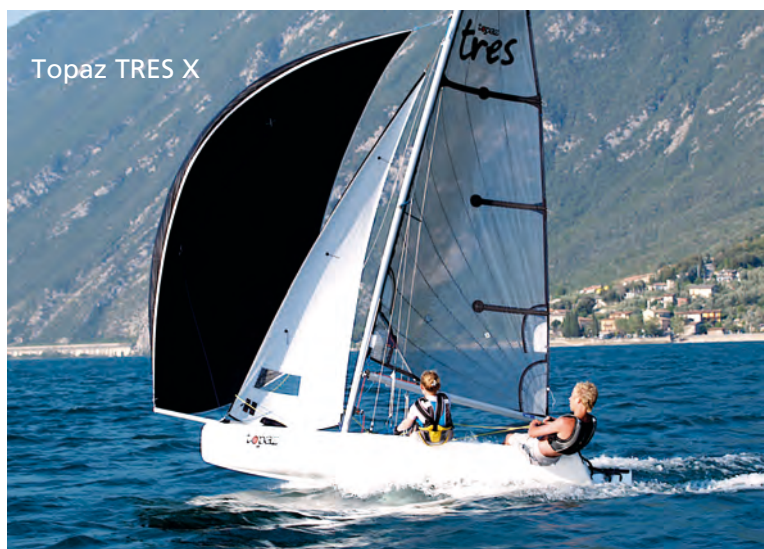
Topaz TRES X