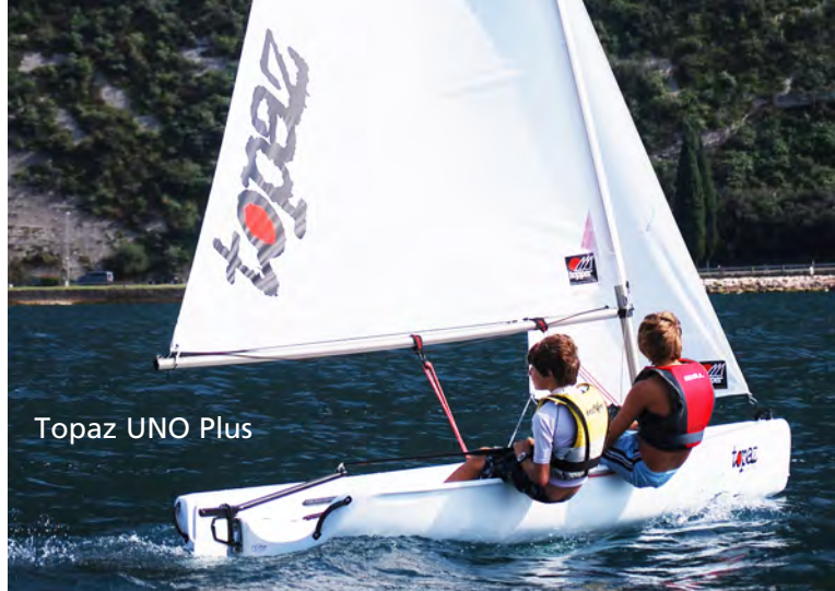
Topaz UNO Plus

A trapeze, powerful fully battened main, high aspect ratio jib and ample gennaker complete the set-up. The TOPAZ is transformed into a two-person, three-sail flye with a pedigree performance feel - yet no loss of the outstanding stability and vice-free temperament of the TOPAZ UNO options.